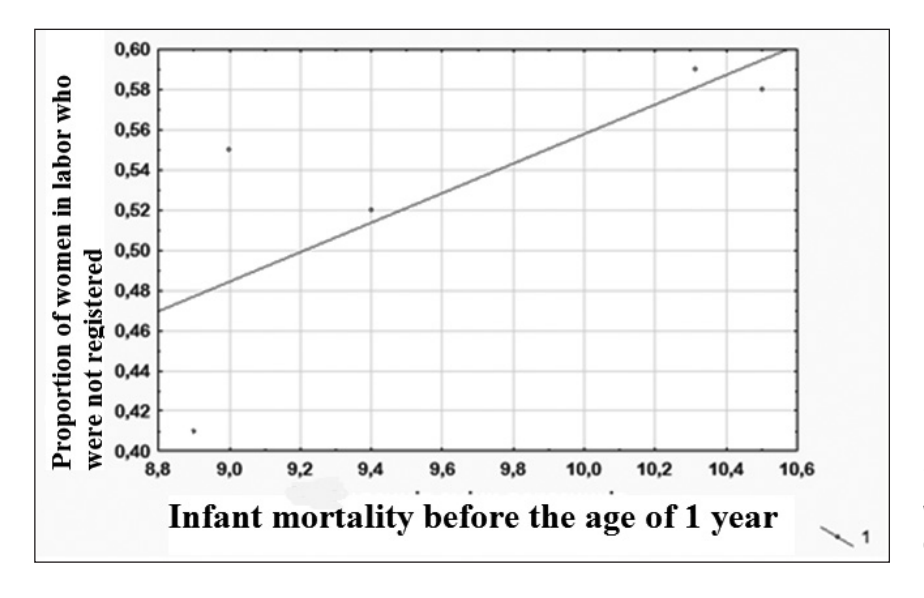
Figure. 3. Regression model of the dependence of infant mortality rates and the proportion of women who gave birth without ever attending a women's consultation (2016).

According to WHO, the main reasons for the high level of perinatal mortality and infant mortality in Ukraine, as in most European countries, are not only the deficiencies of the PC system, but also the attitude of future mothers to their health and the health of the unborn child. If in developed EU countries the indicator of the proportion of women who have given birth without ever having visited the antenatal clinic is practically zero, then in Ukraine this indicator ranges from 0.3-1%. In the Transcarpathian region, in particular, this coefficient with a positive trend of changes for the period 2012-2016. Still holding high. When constructing a regression model between the mortality rates of infants and the proportion of women who gave birth in Transcarpathia, never having visited a antenatal clinic, we obtained reliable data on the dependence of these two indicators (Figure. 3).