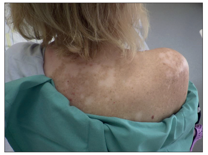
Fig. 1. Picture of the vitiligo on the back of the patient